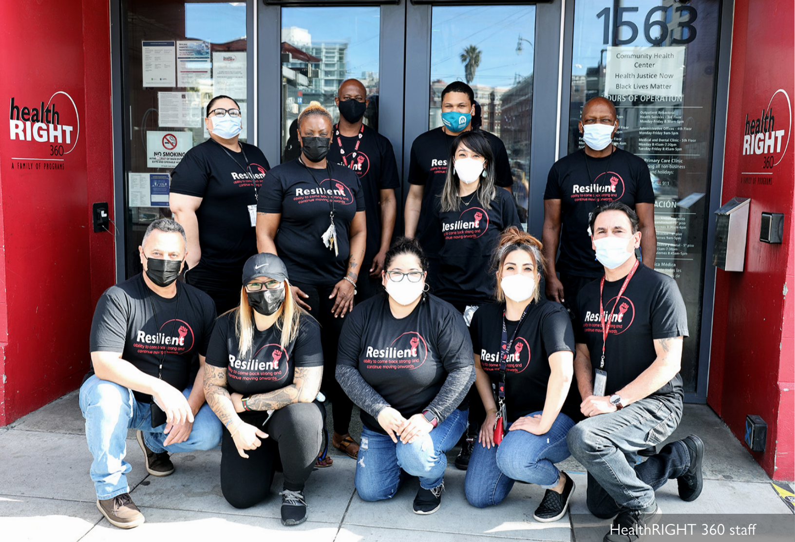
HealthRIGHT 360 staff