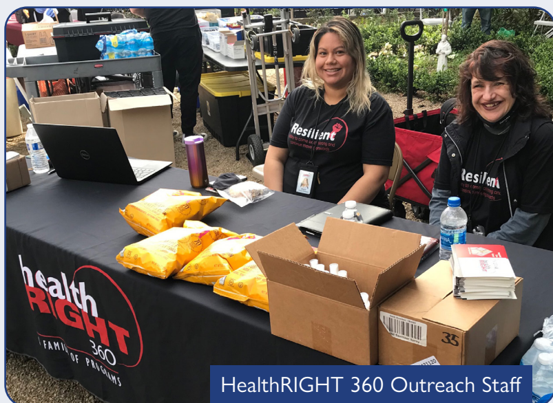
HealthRIGHT 360 Outreach Staff