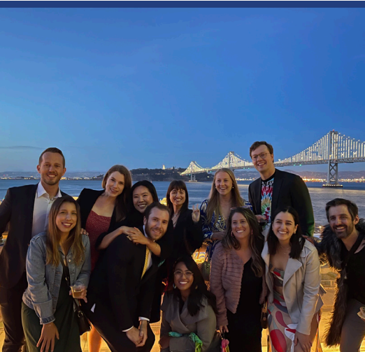
HealthRIGHT 360's Black Tie & Tie Dye Happening 2022

A big thank you to everyone who stepped up and stepped out for our annual Be the Change Breakfast . Because of your support, we raised almost $500K to provide critical services for mental health issues, substance use disorder treatment, homelessness, and chronic medical needs for vulnerable people. This breakfast is a meaningful morning that highlights HealthRIGHT 360's life-changing work in our community. We hope to see you at our Be the Change Breakfast on Wednesday December 7th, 2022!