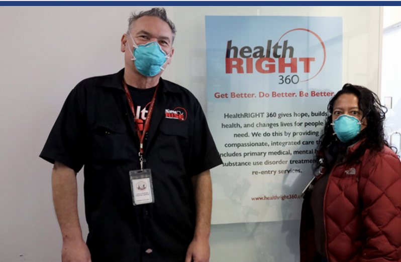
HealthRIGHT 360 Staff at the Tenderloin Center

Through this program, HealthRIGHT 360 provides primary care and specialty care to Medi-Cal recipients who are Alameda Alliance members.