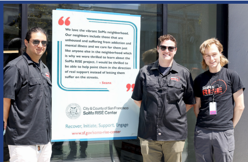
HealthRIGHT 360 Staff Outside the SoMa RISE Center