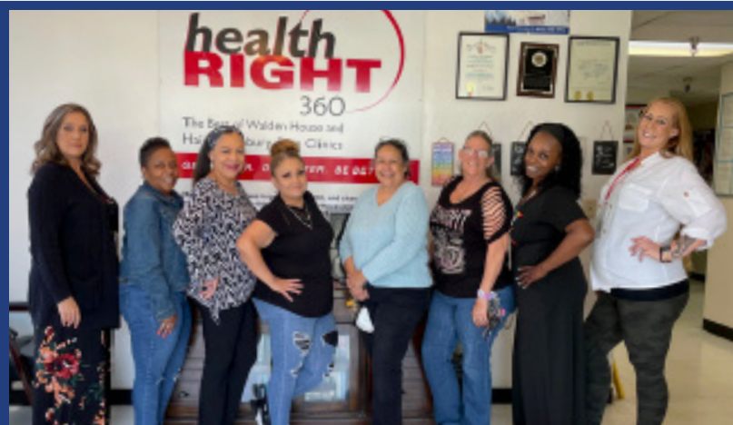
Walden House Female Offender Treatment and Employment Program Staff