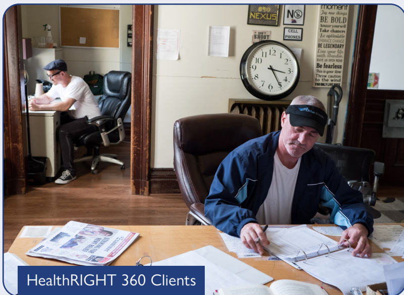
HealthRIGHT 360 Clients