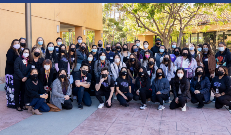
Asian American Recovery Services' Sister to Sister Leadership Conference 2022

Women's Recovery Association in San Mateo provides a comprehensive continuum of care including residential treatment programs, professional clinical services, and community peer support. The comprehensive programming includes individual and family counseling, group therapy, and educational groups that focus on women's recovery from substance use disorder and related addictive behaviors.